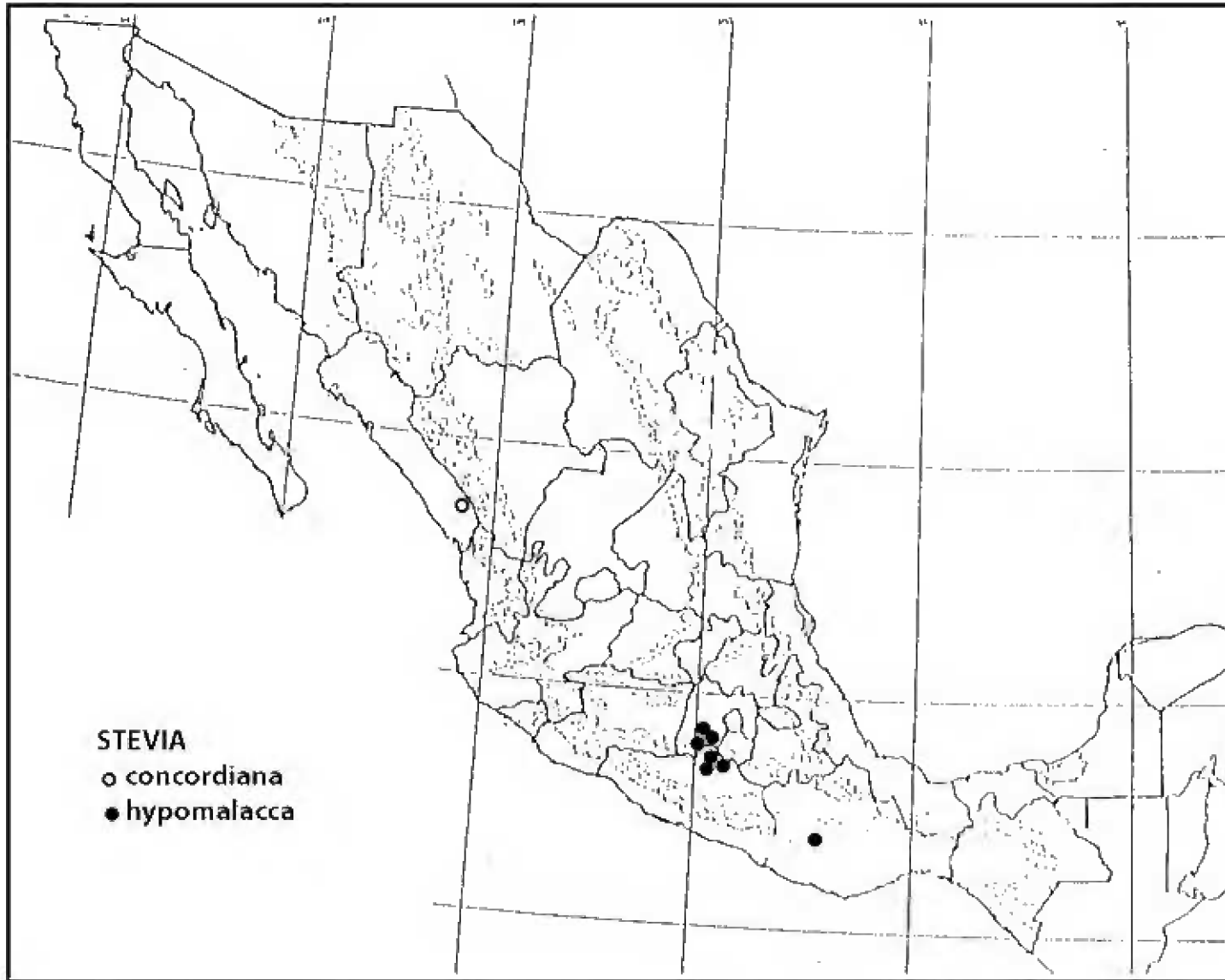
Fig. 3. Distribution of Stevia concordiana and S. hypomalacca .